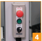
4 "Blocked" button for jams & replacing bottom tape roll