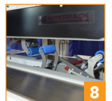
8 Offset tape heads process 2" high cases