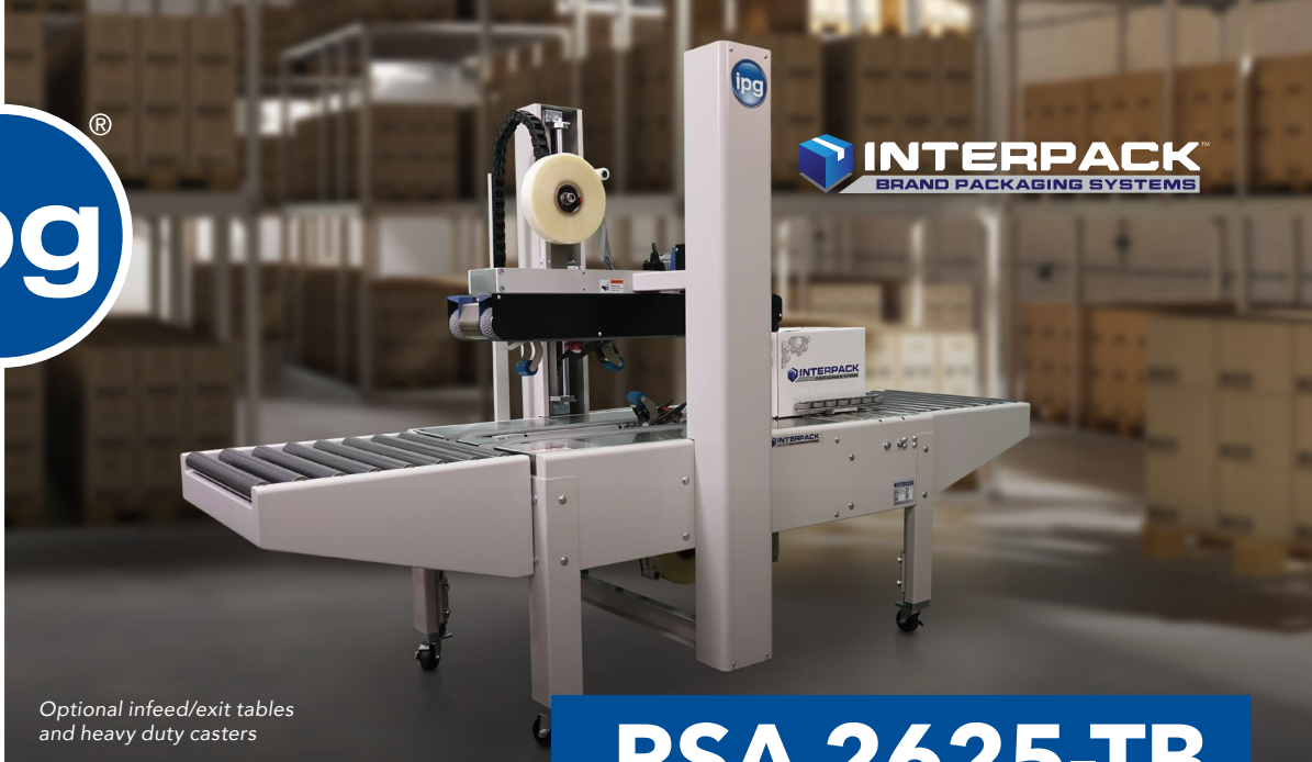
Optional infeed/exit tables and heavy duty casters