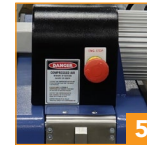
5 Secondary E-stop