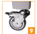
9 Optional swivel & locking casters