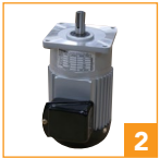
2 One 1/2 HP motor & one 1/4 HP motor