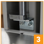
3 Selectable minimum height