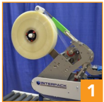
1 Tip-up tape head simplifies roll replacement