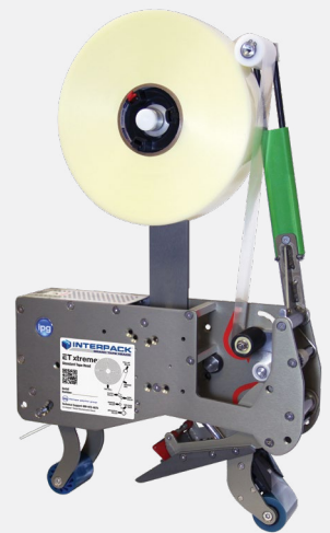
ET Xtreme™ Tape Head

Featured with the newly designed Interpack RSA case sealer is the next generation ET Xtreme™ tape head housing patented technology that safely provides optimal tape application and wipe down - even on recycled corrugate. Superior wipe down on each of the three taped panels is achieved with innovative design while minimizing force, thus, virtually eliminating crushed or damaged cases. When you compare features, benefits and value, Interpack Case Sealers are the right choice for your demanding job.