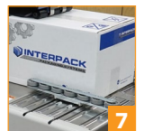
7 Horizontal centering guides with rollers