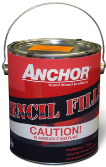
IPG/Anchor Filler #211