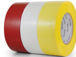
PE7 Polyethylene Tape