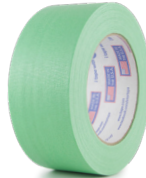
PT8 8-Day Clean Removal Masking tape