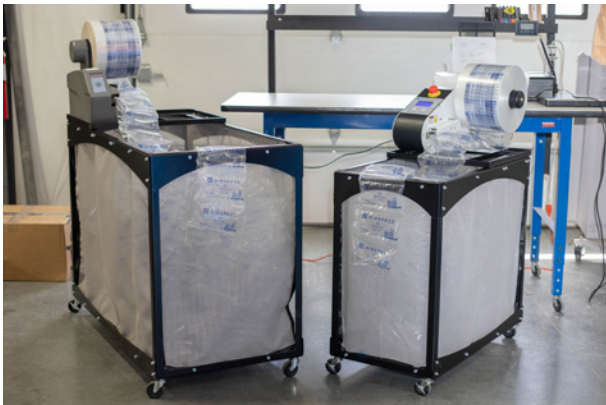
Rover Portable Cart, large and small