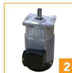
2 Twin 1/3 HP motors to process cases up to 85 lbs