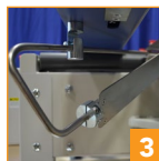
3 Rotating flap plows improve flap folding