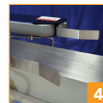
4 Case retainer in-feed guides