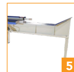
5 "T" rail station improves case set up and packing