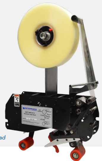
ET 2Plus tape head

When you compare features, benefits and value, Interpack Case Sealers are the right choice for operators, plant engineers, maintenance and purchasing.