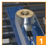
1 Self-tensioning & self-tracking drive belts simplify belt replacement