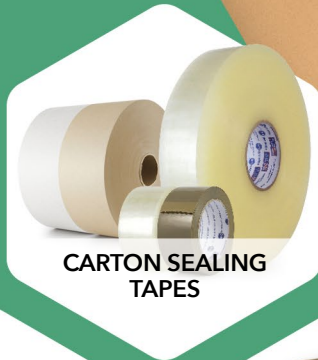
CARTON SEALING TAPES