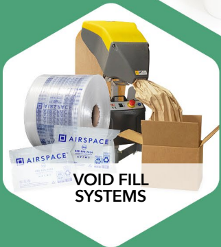
VOID FILL SYSTEMS