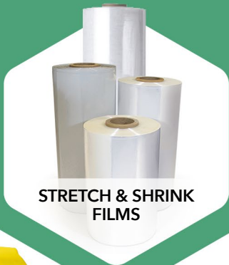
STRETCH & SHRINK FILMS

We offer a wide range of differentiated performance-advantaged solutions across carton sealing tape and equipment, protective packaging, and automation.