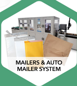
MAILERS & AUTO MAILER SYSTEM