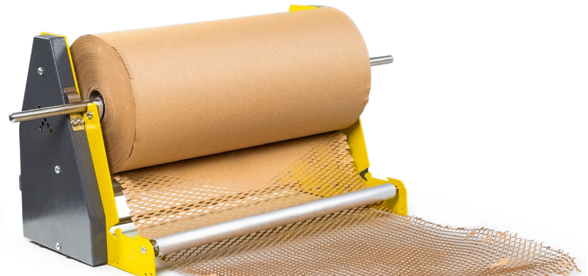
X-Wrap 380mm Dispenser