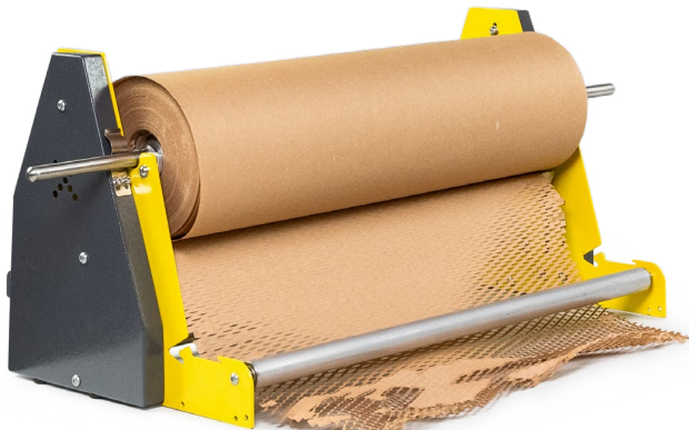
X-Wrap 490mm Dispenser

We use recycled and biodegradable paper to stay true to one of our main missions: environmental sustainability and protection of our planet.