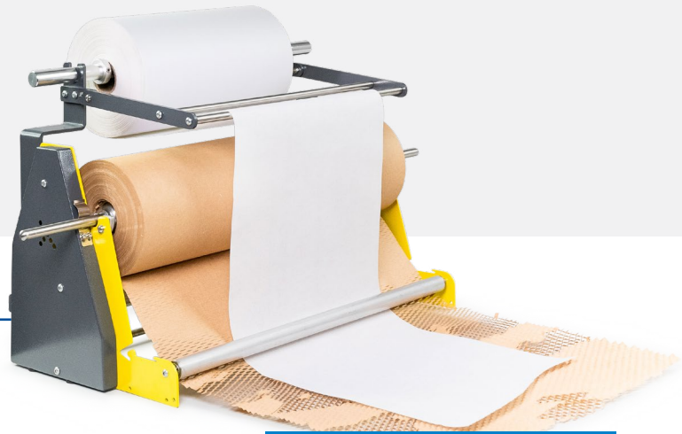
X-Wrap 490mm Dispenser with Interleaf paper

The compact and simple design enables visually appealing product protection for sensitive and fragile products. The different widths allow the system to be perfectly integrated into the process.