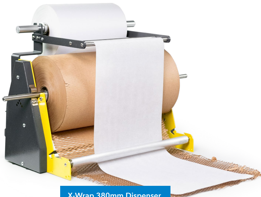
X-Wrap 380mm Dispenser with Interleaf paper